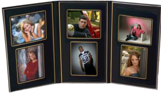
Folio 4.....$ 70 Folio 6.....$ 100

These are retouched, cropped, & color corrected images, NOT “proofs”. You select the images you want in your folios, books, or albums.