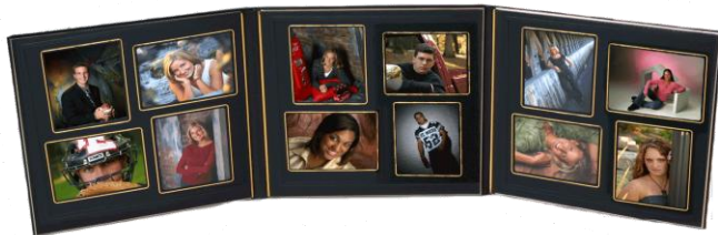
Folio 12.....$ 190