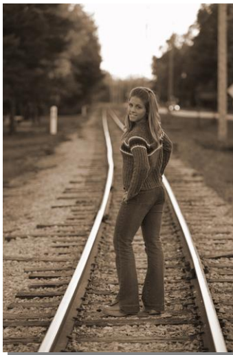
Sepia Tone No extra charge.