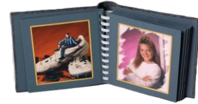
Album 20....$ 300