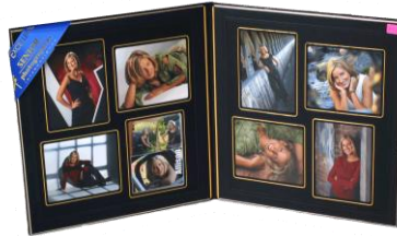
Folio 8.....$ 125