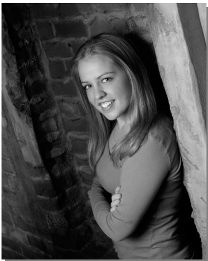
Black & White No extra charge.